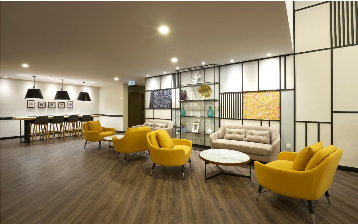
Inspiring communal area for Hotel guests.

Designed by Mantra Design Studio, an interior design firm specializes in the design of hotels and resorts for Berjaya Properties in Malaysia and abroad, the interiors feature a bold and inspiring lobby cum common area for guests to mingle, share holiday moments and exchange travel plans with other like-minded travelers. Guest services include 24 hours reception and reliable security for comfort and peace of mind while staying at the hotel. Grab & Go snacks and drinks kiosk, as well as an in-house self-service launderette are readily available for guest's convenience.